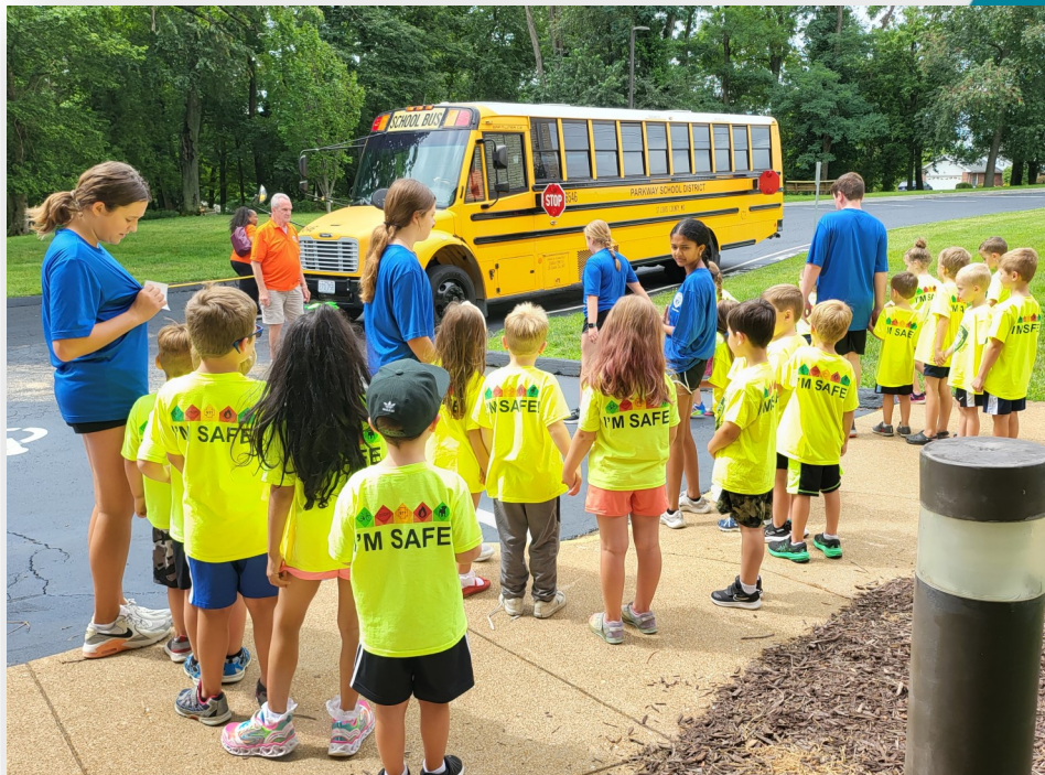
The Bus Safety Lesson at Safety Town