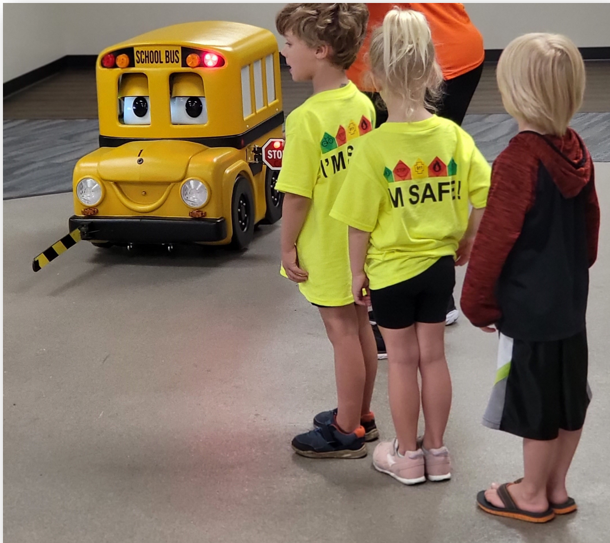
Buster the Bus of the Parkway School District Transportation Department's Team Buster helping to teach the Bus Safety Lesson at Safety Town.